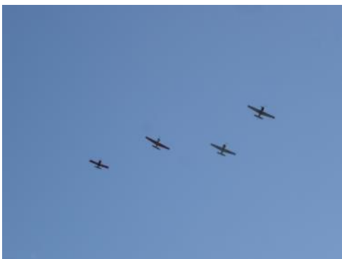
3 Yaks & RV-8 during the flyover of the Veterans ceremony.