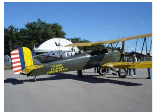
EAA's Consolidated PT-1/PT-3