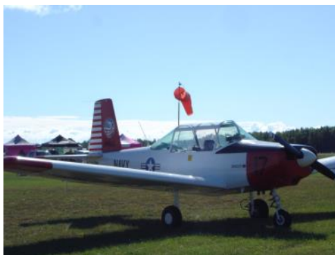
KOCQ - Badger 6 Squadron fly-in. VARGA!